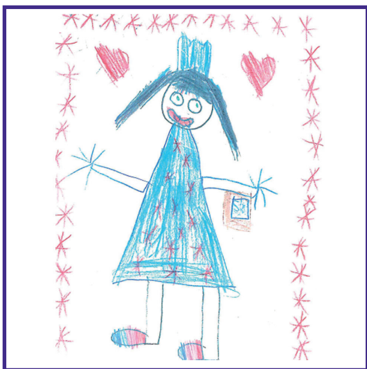
Drawing by Sophie - Calthorpe School 1st place in SSN Art competition 2021